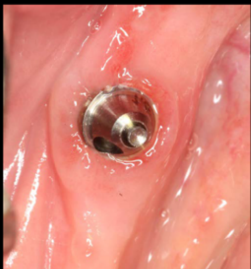
Fractured screw in multi-unit abutment of fixed implant retained bridge

UH OH! WHAT NOW? Who is going to help you fix this problem?